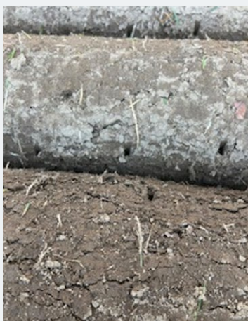
Great quality root system for quick establishment after delivery.

Bernie farms 300 acres of turf sod and like other turf sod growers in Ontario he has been challenged with changing weather patterns.