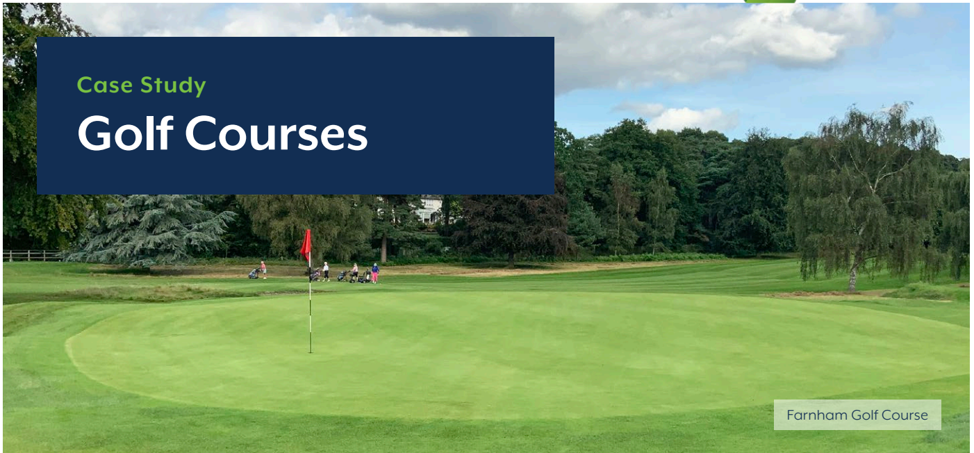
Farnham Golf Course