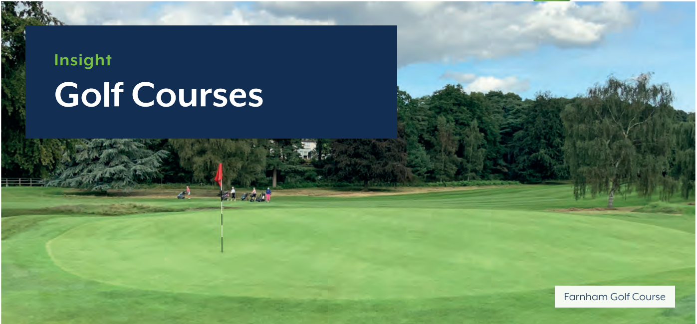
Farnham Golf Course