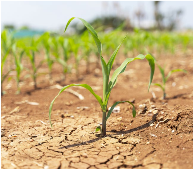
Abiotic stress can be caused by drought conditions

Following robust research and development, Maxstim recently released its silicon based biostimulant, Cynosa. To better understand the role of silicon as a biostimulant, we've put together comprehensive technical notes demonstrating its effect on arable crops, horticulture and sports turf.