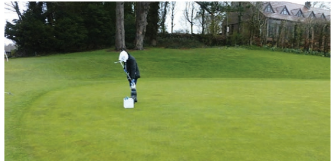
MAXSTIM TREATED GREEN

Maxstim™ is a trademark of Maxstim Ltd | Ref:Max.021v2