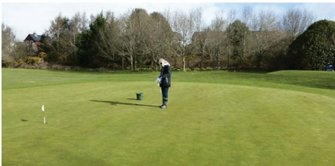
CHIPPING GREEN - USED AS CONTROL